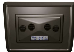
Upholstery with air distributors and control panels

Jump of temperature in a calibrated and certified climatic chamber